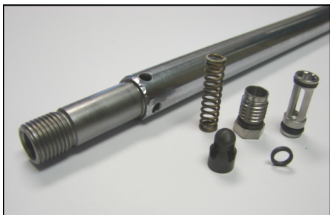
Figure 1: HSRB Shaft Internals