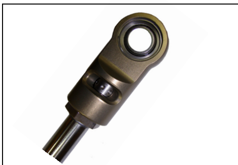
Figure 2: HSRB Shaft Sweep Eyelet

Approved for use in the NASCAR Sprint Cup Series, the new PS-6020-HSRB shaft assembly allows teams to adjust their critical "zero point" settings extensively without adding bleed to the damper. It accomplishes this by means of a high-precision poppet and spring arrangement which exhausts into a low restriction bypass channel in the shaft. This allows zero point values to be swept in a single damper as the range of adjustment is extensive. What this means for the team is that their critical bump stop set-ups can be maintained and set once as dampers no longer need to be interchanged.